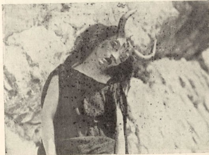
TWO POSES OF IO (PROMETHEUS BOUND)