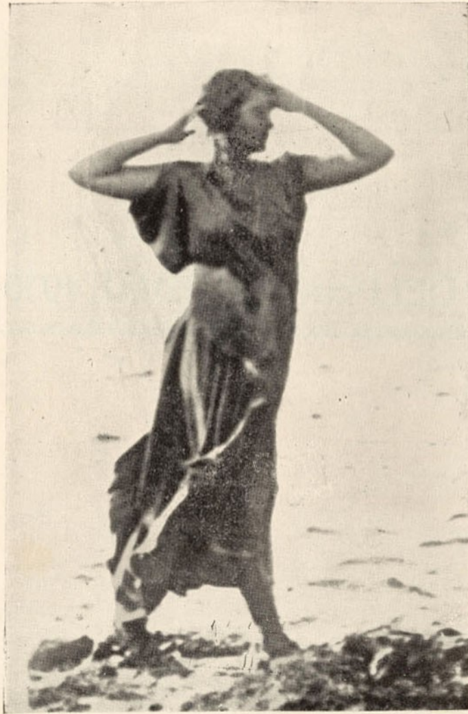
AN OCEANID (PROMETHEUS BOUND)