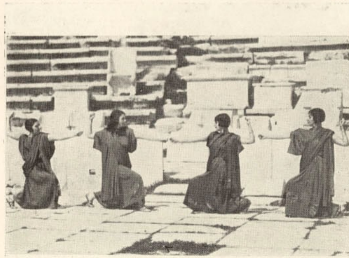
OCEANIDS (PROMETHEUS BOUND)