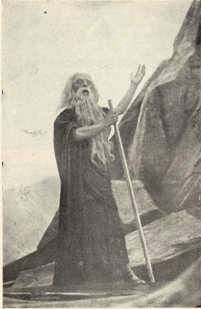
OCEANUS (PROMETHEUS BOUND)