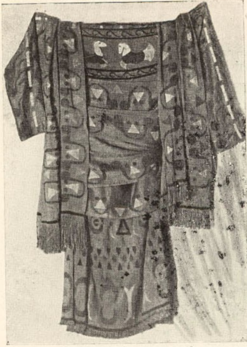
COSTUME OF POWER