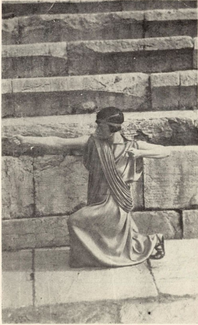
AN OCEANID ( PROMETHEUS BOUND )