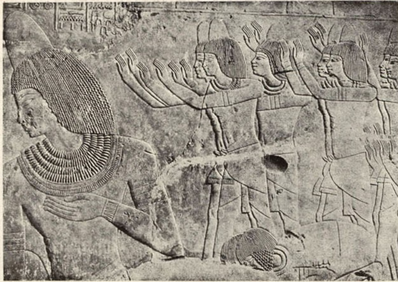
EGYPTIAN SUPPLIANTS BAS RELIEF