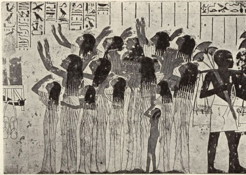
SUPLIANTS EGYPTIAN WALL PAINTING