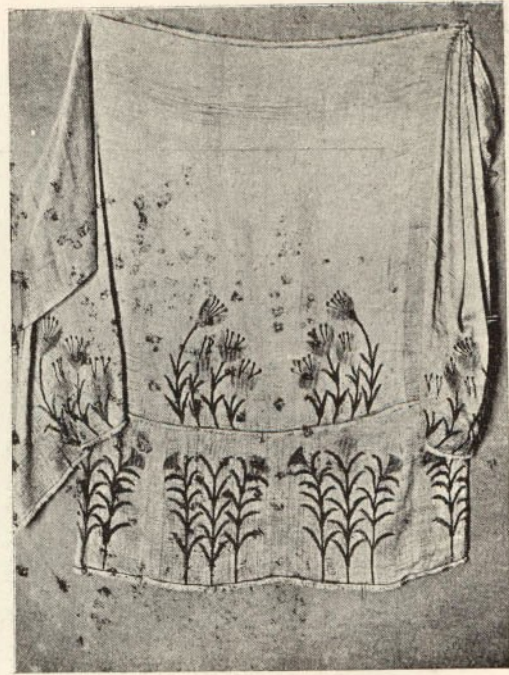
COSTUME OF HERMES