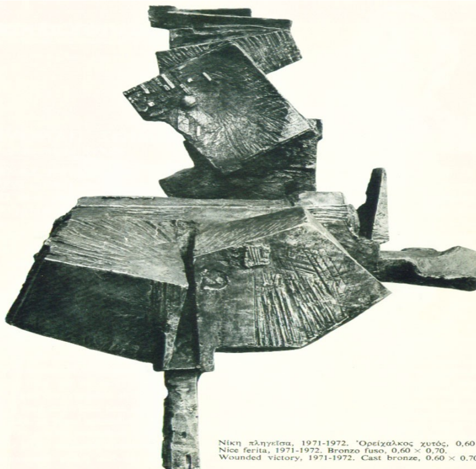
Νίκη πληγείσα, 1971-1972. Ήρειχαλκος χυτός, 0,60×0,70. Nice ferita, 1971-1972. Bronzo fuso, 0,60 × 0,70. Wounded victory, 1971-1972. Cast bronze, 0.60 × 0.70.